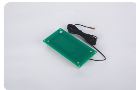
Bottom of EA2602-BL