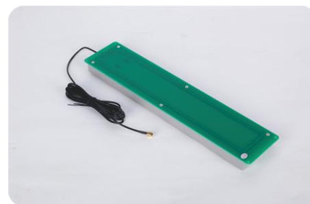
Bottom of EA2603-BL