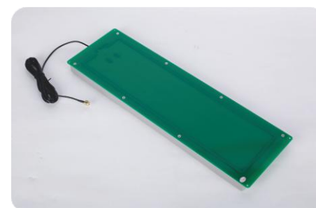
Bottom of EA2606-BL