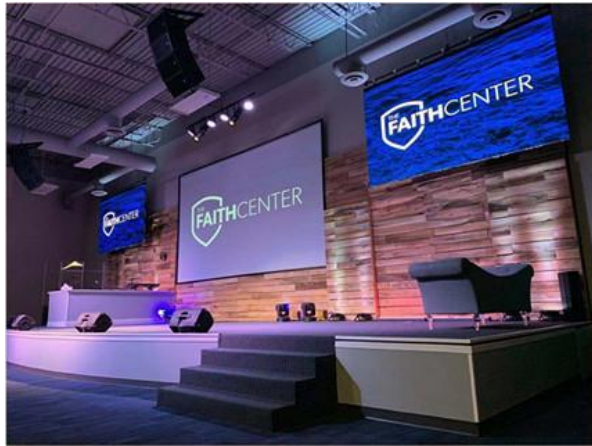
Church Project in Georgia,US

Kindly check below pictures which are from our client's feedback: