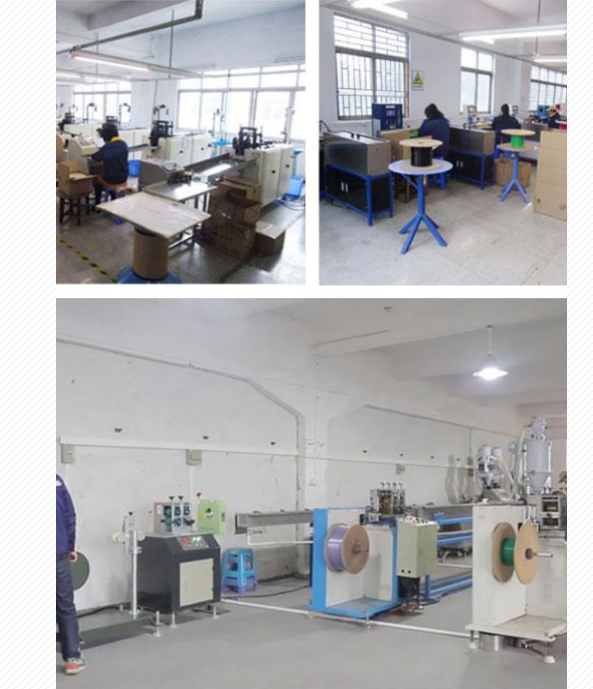
Single spiral coil production area